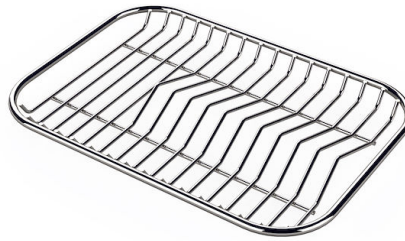
Stainless steel plate rack 8100 154