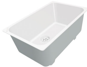
White bowl 8153 100