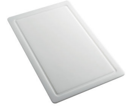
HPDE Chopping board 8657 001