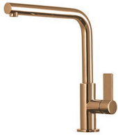
Mixer Tap Omega Copper