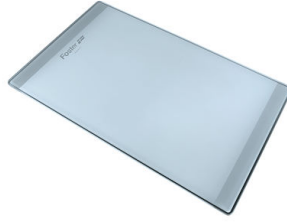
Glass chopping board 8631 300