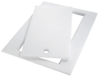
HPDE Twin chopping board 8644 101