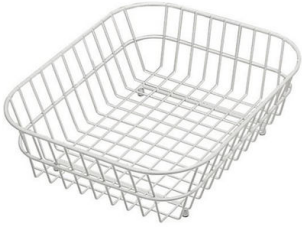
Cestello inox 8612 000